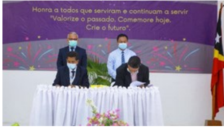
Signing of Technical Cooperation between National Directorate of External Trade & CA on 27 Sept, 2021