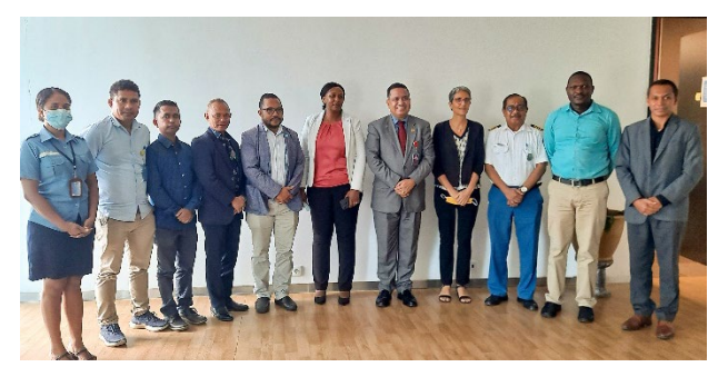
Vice Minister of Finance H.E Antonio Freitas chaired the 6th PSC meeting for the Timor-Leste Electronic Single Window (TileSW) project

The TileSW project convenes the Project Steering Committee (PSC) meeting on a quarterly basis. PSC is a 'high-level' committee that provides continuing oversight, policy guidance, coordination, and conflict resolution on behalf of the Government of Timor-Leste during the project implementation phases to ensure the successful implementation of the National Single Window in Timor-Leste. Hence, on Thursday, 16 June 2022, the Vice Minister of Finance, H.E. Antonio Freitas chaired the sixth Project Steering Committee (PSC) meeting for the Timor-Leste Electronic Single Window System powered by UNCTAD ASYCUDA that was held in level 10 of the Ministry of Finance office.