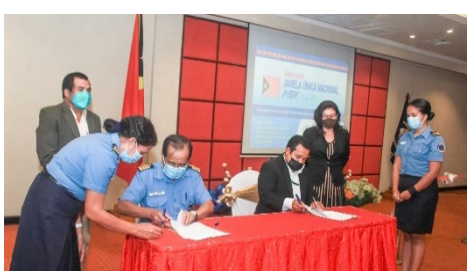
Signing of Technical Cooperation between National Ozone Unit & Customs Authority on 30 Sept, 2021