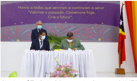
Signing of Technical Cooperation between SAMES, I.P & Customs Authority on 27 Nov. 2021