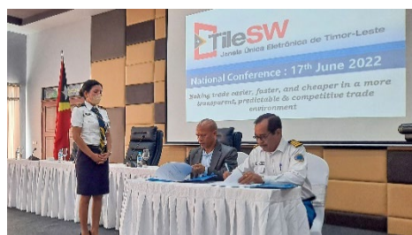
Signing of Technical Cooperation DNTT & Customs Authority on 17 June, 2022