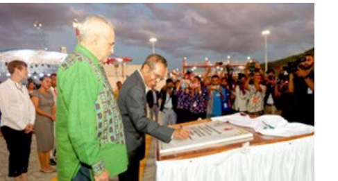
Inauguration of Tibar Bay Port on 30 Nov, 2022 by H.E President of TL and H.E Prime Minister of TL